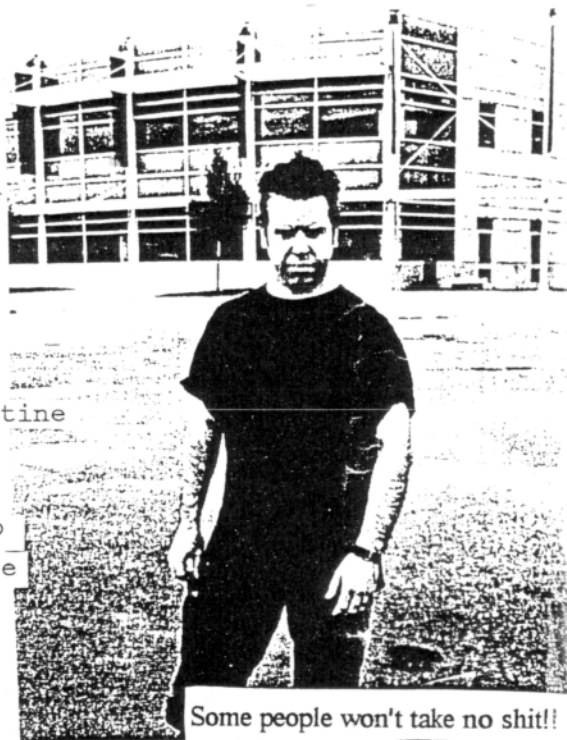
Vadge at Columbine:

one of the best looking men in show business.